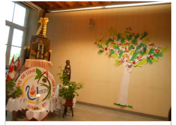
Symbolic expressions of the participants' spiritual journey

The closing prayer ritual and Eucharistic Liturgy were equally as inspiring as the opening prayer ritual. The principle theme was light and each sister was invited to write her personal gift on a symbolic flame which she will bring to her Province.